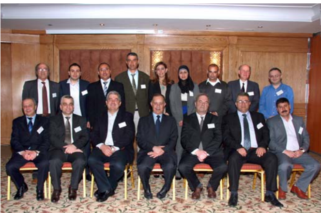
Figure 2: Participants of the kick off meeting in Amman