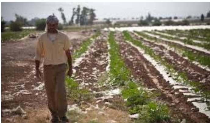
Figure 3: Farmer in Jordan Valley

outcomes of this endeavour will further help researchers better refine their findings, policy makers better couch their decisions, and countries involved better plan their resources towards achieving national development objectives.